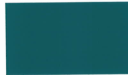
DEEP WATER GREEN